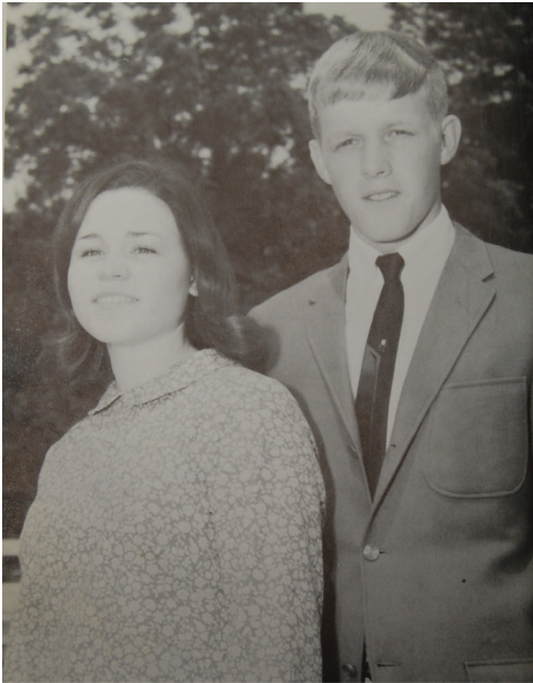
Mr. & Miss Trinity 1967-1968